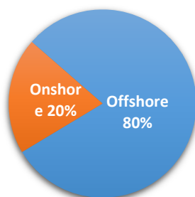
By Delivery Mix (FY22)